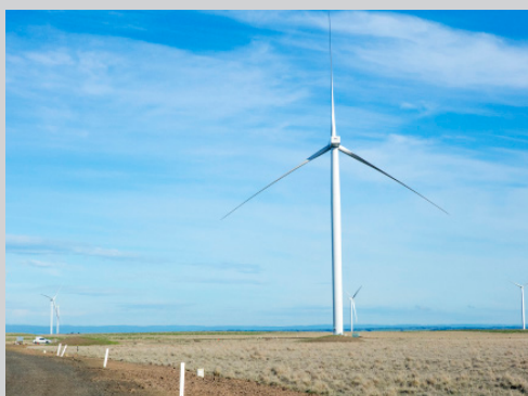
▲ Mt Gellibrand Wind Farm (under construction), VIC