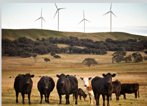
▲ Gunning Wind Farm (under construction), VIC