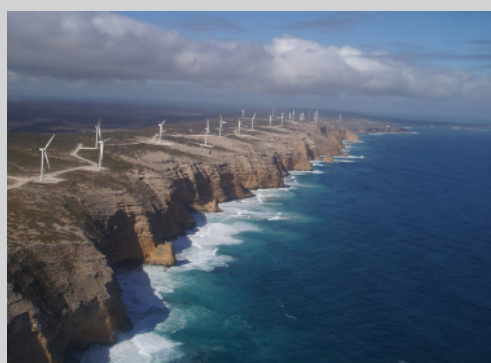
▲ Cathedral Rocks Wind Farm, SA